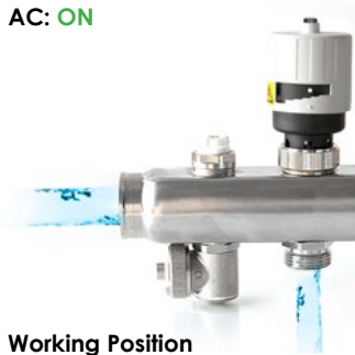
Working Position Actuator ON

“ MCA is characterised by innovative features, which cannot pass unnoticed in nowadays Market, where innovation is required in order to be competitive.