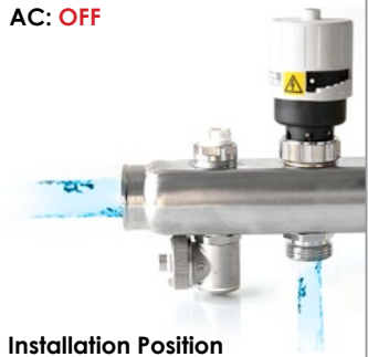
Installation Position Manual opening position