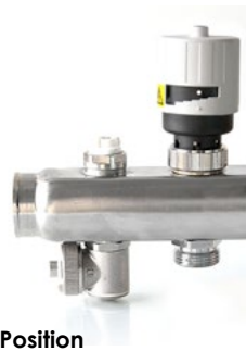
Working Position Actuator OFF